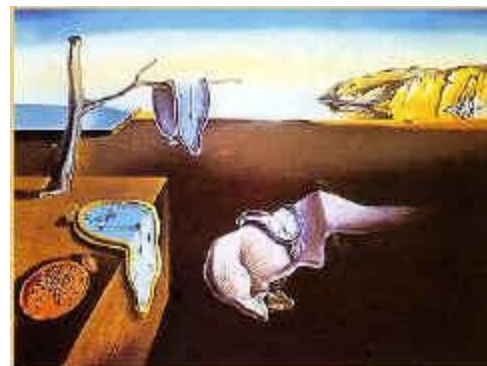
The Persistence of Memory 1931 Salvador Dali