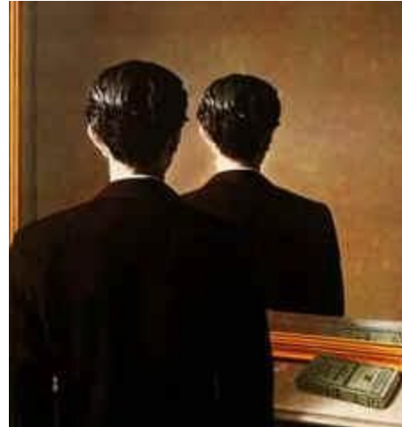
Not to be Reproduced 1937 Rene Magritte

The third main Surrealist tendency drew attention to the materials used by the artist. It began with the 'automatic' drawing technique practiced by Miro, Paul Klee and Andre Masson (b 1896). The line of the pen was allowed to rove at will without any conscious planning. Masson tried to achieve the same sort of result in painting, drawing a mass of lines in an adhesive substance, adding color by coatings of different colored sand.